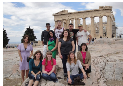
2012 Class at the Parthenon.