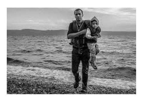
taken on Eftalou beach near Molyvos, Lesvos.

As many as 1,000 people a day have come ashore from nearby Turkey, straining the ability of the residents of the island to help. This has been the lead story on the BBC News, CNN, The New York Times, as well as the Greek news-