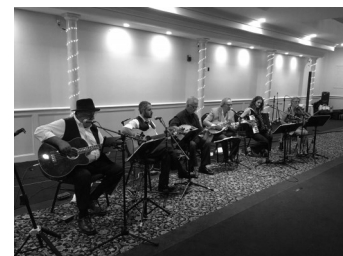
The Rebetoparea Band.