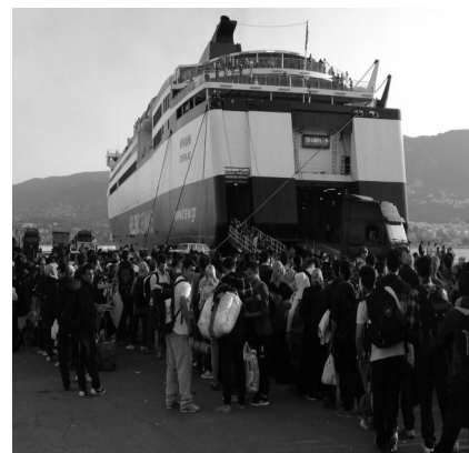
Thousands of refugees board a Piraeus-bound ferry from the port in Mytilene on Lesbos. In summer, at least two ferries per day left the port.

This summer and fall the refugee crisis got much worse on Lesbos – which has become the epicenter of the wave of migrants and refugees that are flooding into Europe through Greece.