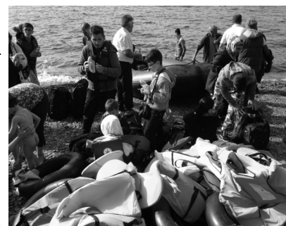
A raft of refugees unloads on a beach in Molyvos, Lesbos—piles of life vests in the foreground.

The situation seems to improve, then worsens as the flow of people slows with bad weather, then picks up again. All of Europe is coping with this historic dislocation since most of the refugees and migrants move on toward the North. Countries are closing their borders to all but legitimate war refugees, which has created a backlog all along the migration route, including now in Greece — a country faced with so many problems of its own.